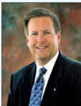
David Voss, Commissioner Board of Airport Commissioners

On December 14, 2004, the LA City Council created the LAX Master Plan Stakeholder Liaison Office as a part of an ordinance that established the LAX Specific Plan. This action provides 'stakeholders,' especially in those communities adjacent to LAX, with a great communications conduit to voice concerns and opinions on the implementation of a major public works program with regional benefits - the LAX Master Plan.